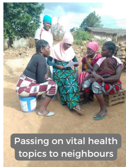
Passing on vital health topics to neighbours

We are delighted to work with JpS & secure a grant of 59,000 Euros from Else Kröner-Fresenius-Stiftung to support Dois anos para a Saúde working in a Ngauma district over 2 years.