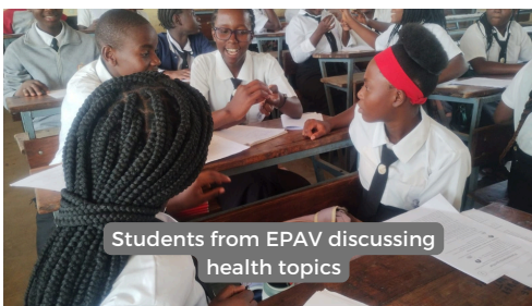
Students from EPAV discussing health topics

A Vida Continua - action at both community and hospital level to improve the lives of people with severe mental illness and people who have had a stroke.