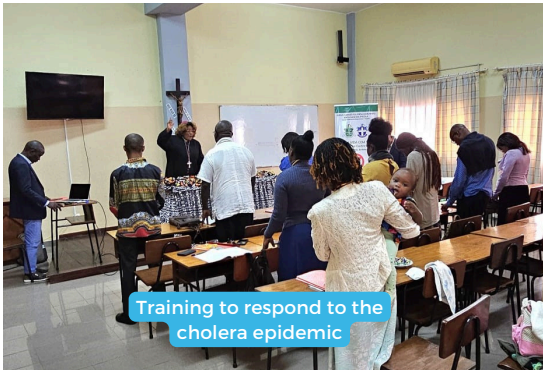
Training to respond to the cholera epidemic

These events are a stark reminder of the profound reality of climate justice : the communities who have contributed the least to global carbon emissions are currently bearing the heaviest burden of climate catastrophe.