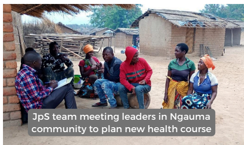
JpS team meeting leaders in Ngauma community to plan new health course