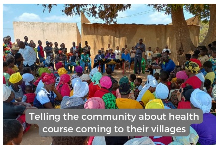
Telling the community about health course coming to their villages