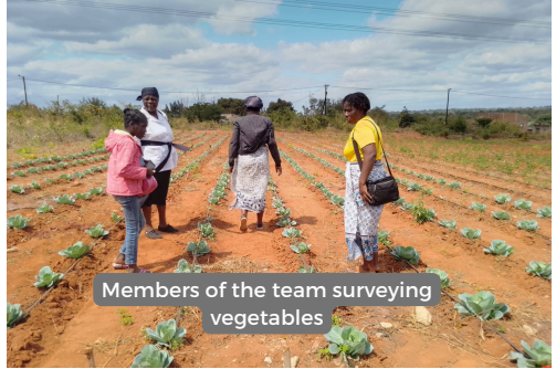
Members of the team surveying vegetables

So far, they have set up a solar panels & a water tower for an irrigation system . They have planted 200 orange trees, 100 lychee trees, cabbages, tomatoes, cucumbers and mbwete beans.