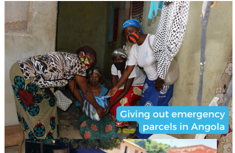
Giving out emergency parcels in Angola

MANNA responded swiftly with emergency grants to support those displaced by severe flooding in Maciene and Libombos, Mozambique in February, as well as the Benguela Province, Angola in April. Last year, MANNA also gave a grant to support a Cholera Emergency Response which was a joint effort between the Diocese of Bom Pastor & Divina Esperança.