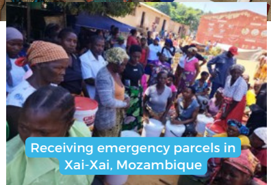
Receiving emergency parcels in Xai-Xai, Mozambique